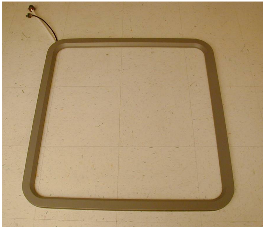
Figure 18c. One-piece EIDI ship hatch de-icer used to break ice accretion and allow hatch to be easily opened.