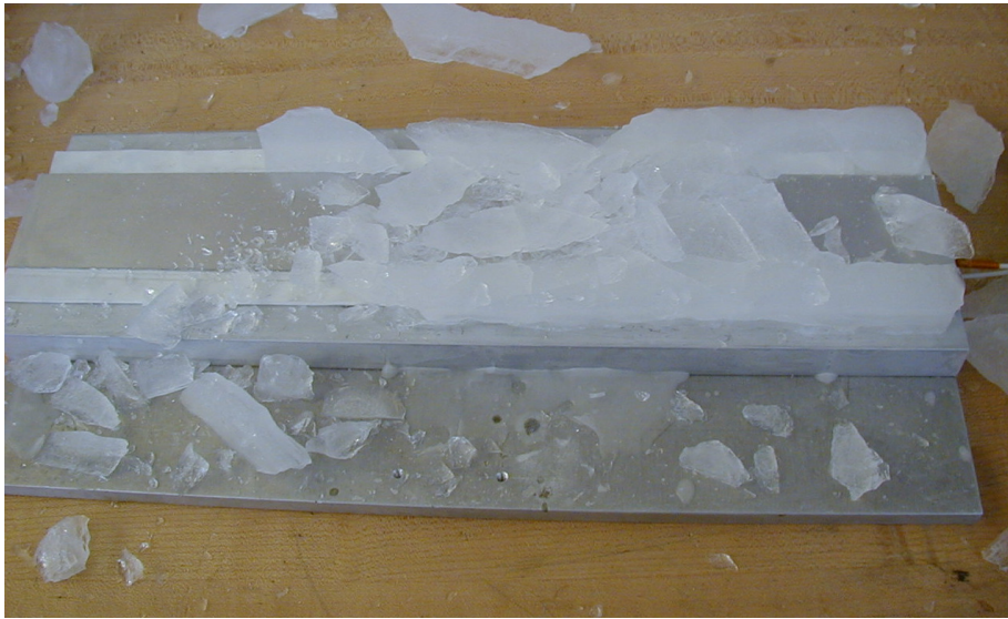
Figure 38b. Single actuator under 3.2-mm metal plate breaking a 25-mm ice sheet (Innovative Dynamics Inc., n.d., ).