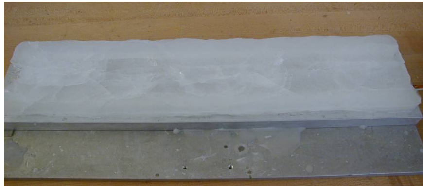
Figure 38a. Single actuator under 3.2-mm metal plate with 25-mm ice sheet (Innovative Dynamics Inc., n.d., ).