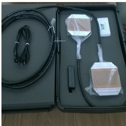
Two IceCap Units, Packaged and Ready for Shipping

The flexible data stream can be integrated with existing telematic systems for easy data transfer to a hand-held or laptop device for real-time monitoring.